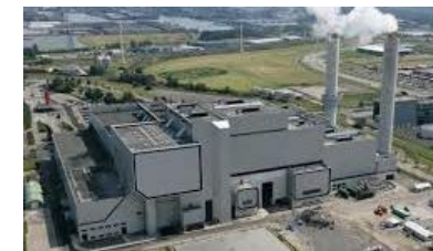
Improved Air Quality