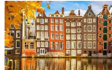
CO2 reduction and Particulate Matter