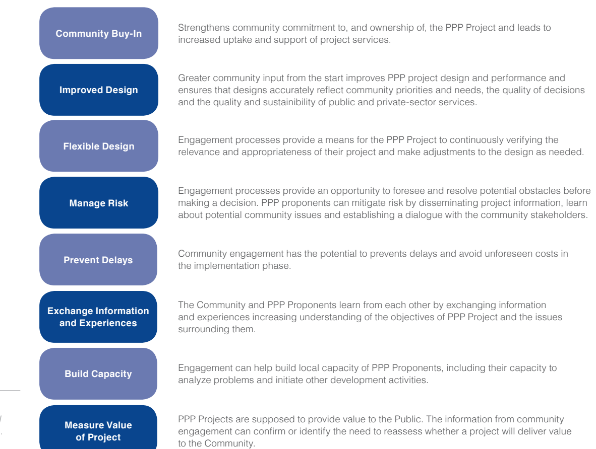
Figure 1: Commonly Recognized Benefits of Community Engagement

<sup>1</sup> Kottak, Conrad Phillip. 1991. Cultural Anthropology . 5th ed. McGraw-Hill.