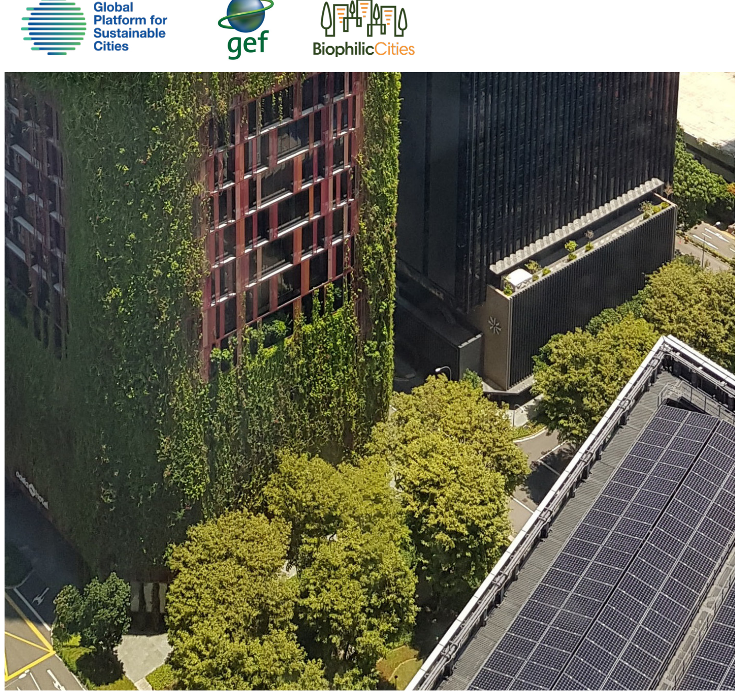
Oasia Hotel in Singapore