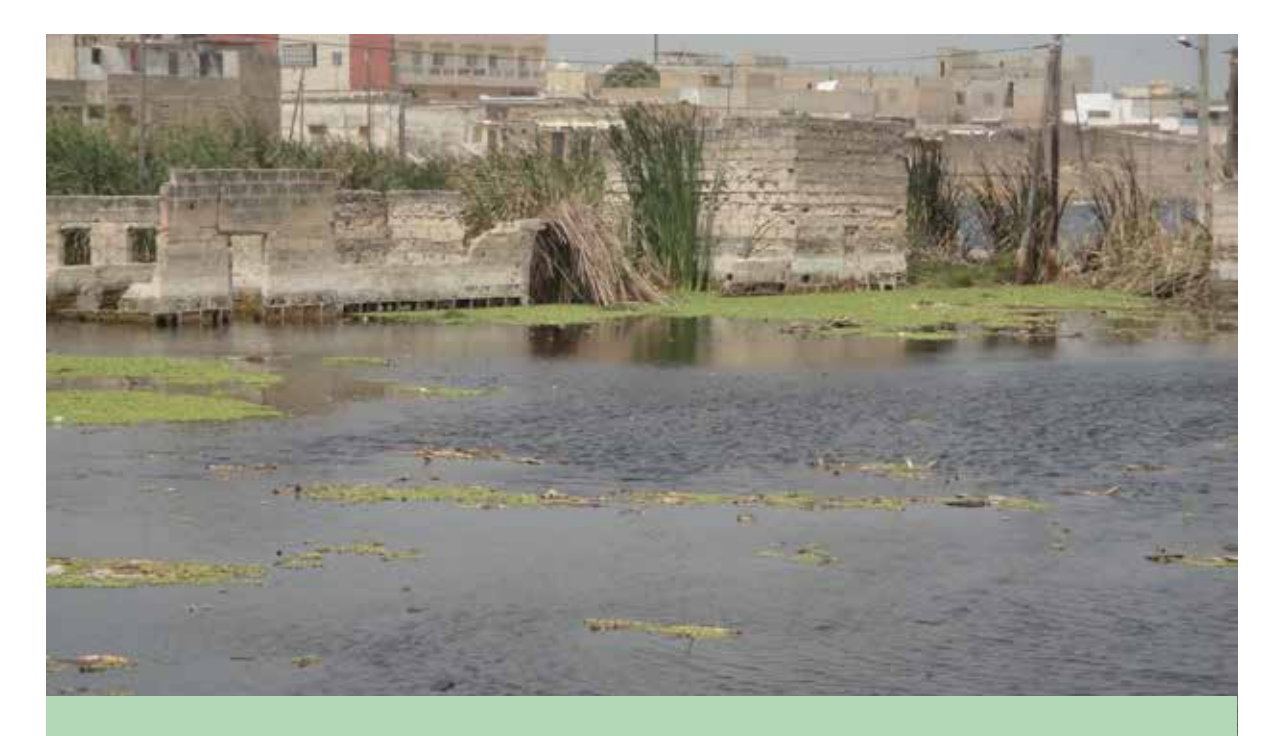
Before the PROGEP project, natural rainwater drainage routes in Yembeul Nord and other districts in Dakar's periurban area, were blocked by accumulated solid waste and uncontrolled building.

1 The Niayes area geography is characterized by depressions and dunes resting on a shallow water table. Inter-dune depressions are composed of lakes, sometimes dried-up, and very fertile lowlands; strictly speaking, Niayes refers to the latter.