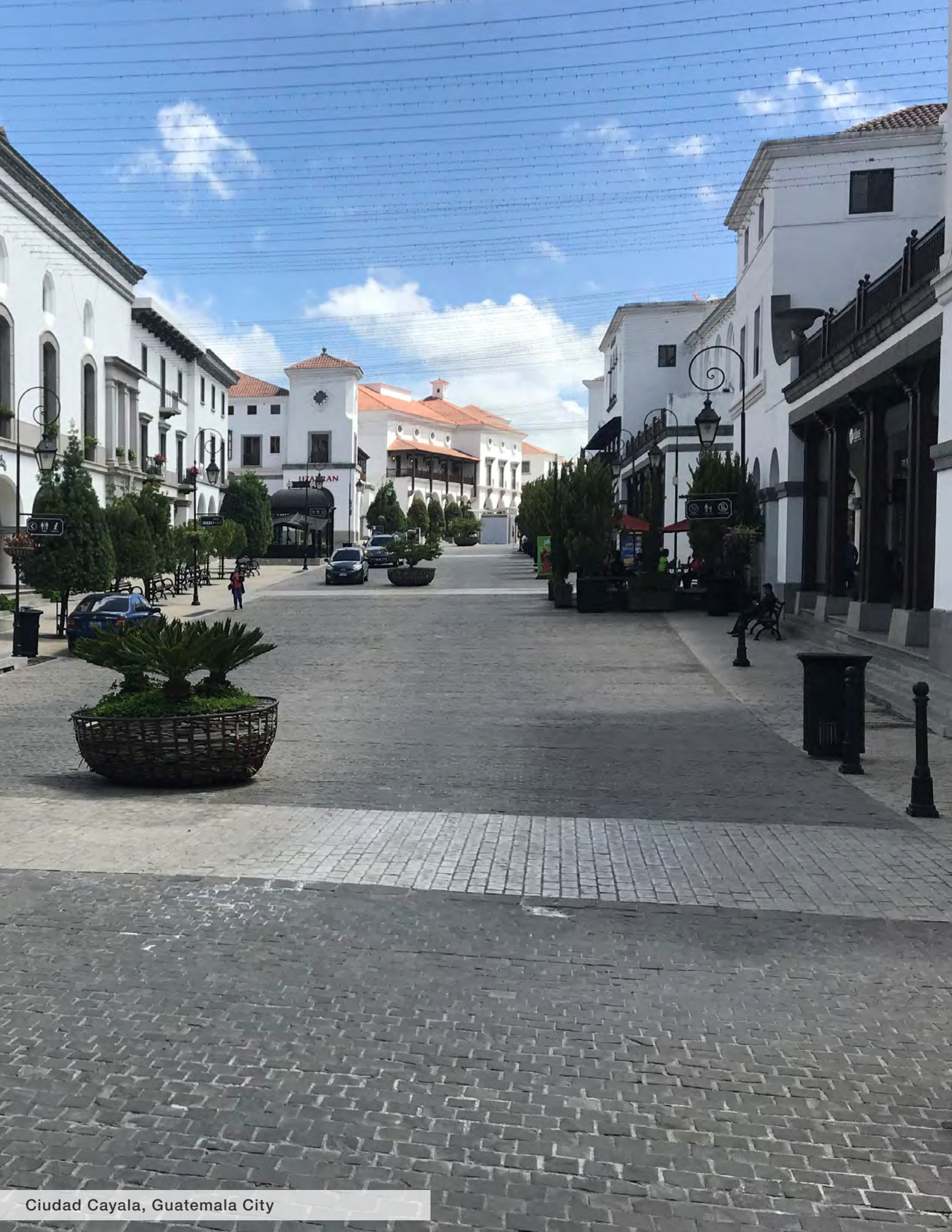
Ciudad Cayala, Guatemala City