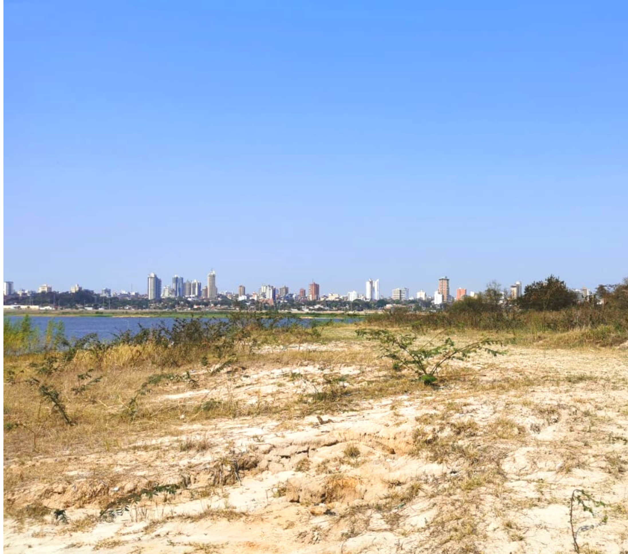
"Playa del sol" beach after the cleaning brigade began their duties.