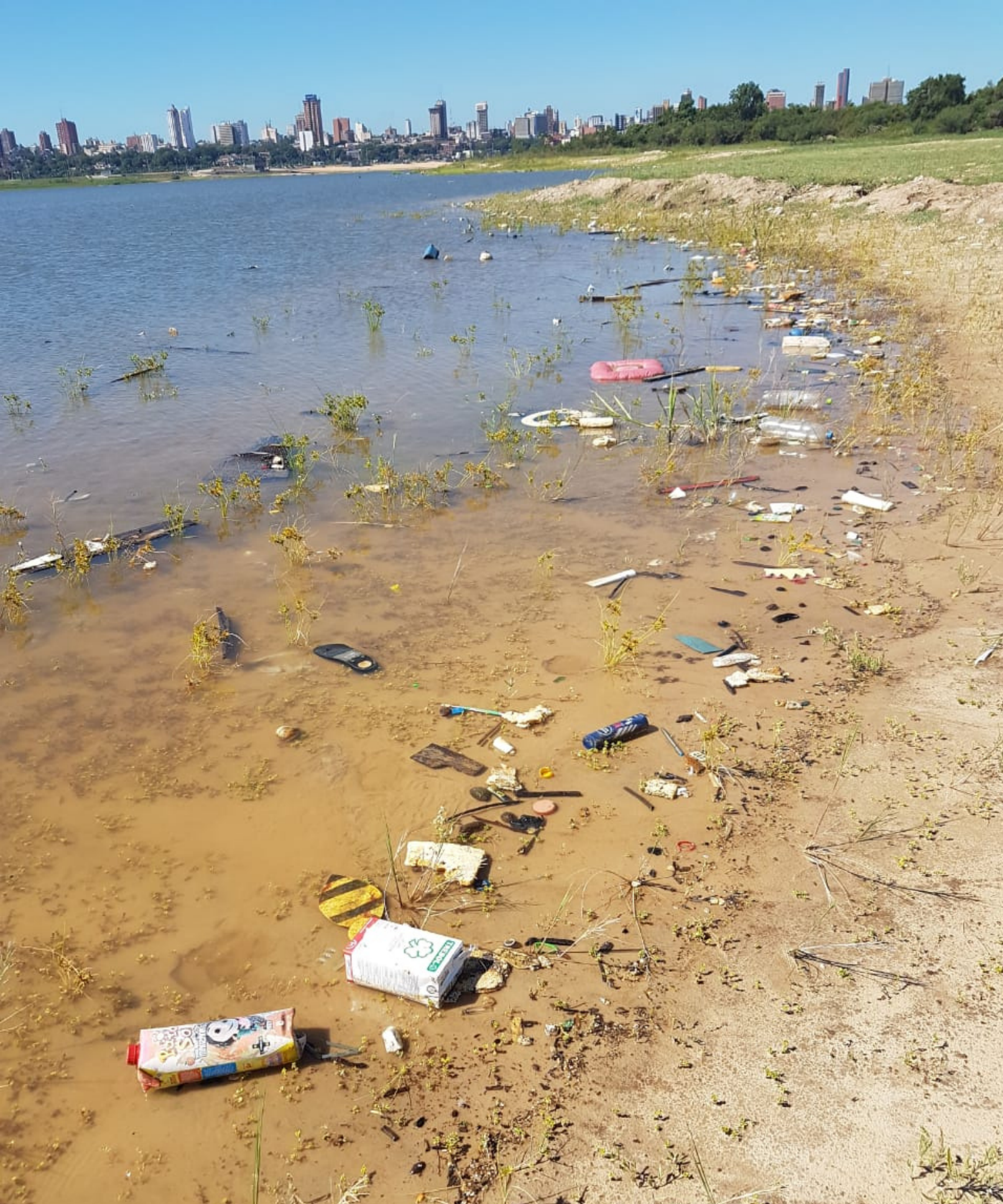
"Playa del sol" beach before.